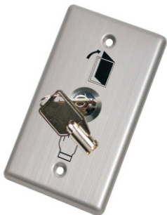
KEY SWITCH CS-AD-ESK84