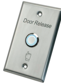
EXIT SWITCH WITH LIGHT CS-AD-ESL85