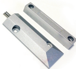
SHUTTER CONTACT CS-AD-SC11