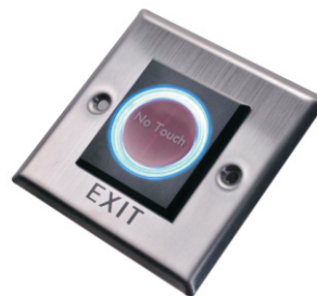
NO TOUCH EXIT SWITCH CS-AD-EST83