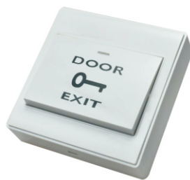
PLASTIC EXIT SWITCH CS-AD-ESP81