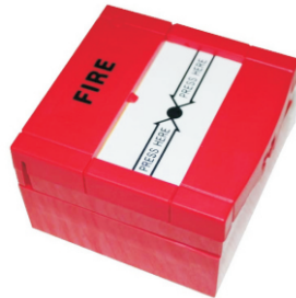
MANUAL CALL POINT CS-AFC-M1