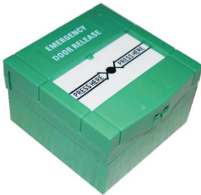
EMERGENCY DOOR RELEASE CS-AD-EDR10