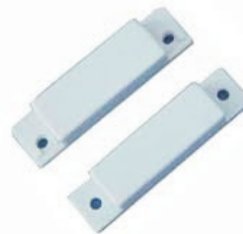
MAGNETIC CONTACT CS-AD-MC700