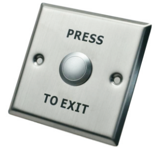
EXIT SWITCH METAL CS-AD-ESM82