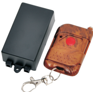
REMOTE CONTROL KEY CS-AD-RM14