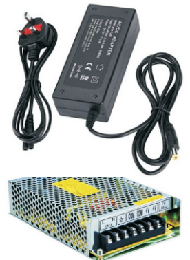
POWER SUPPLY UNIT CS-AD-PSM5-5/12-2 12-3/12-5/12-10

“Haadhi Complex”, Second Floor, 15, Police Commissioner Office Road, Egmore, Chennai - 600 008.