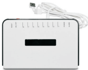
EAS Charging multi control retail anti lost CS-EA-C3