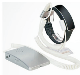
EAS Counter 2 CS-EA-C2