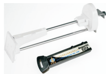
Security Display Hook CS-EA-DH5