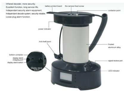
EAS Counter 1 CS-EA-C1

Electronic Article Surveillance (EAS) is a technological method for preventing shoplifting. It usually involves three components: Electronic Antenna. Deactivator or Detacher. Electronic Tag. The tags are removed or deactivated by the clerks when the item is properly bought or checked out. At the exits of the store, a detection system sounds an alarm or otherwise alerts the staff when it senses active tags.