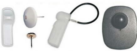
Tags CS-EA-T1 Series