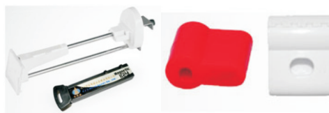
Security Hook CS-EA-H1 Series